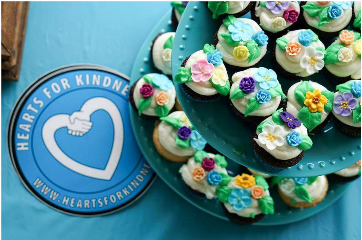
A sampling of the dessert table