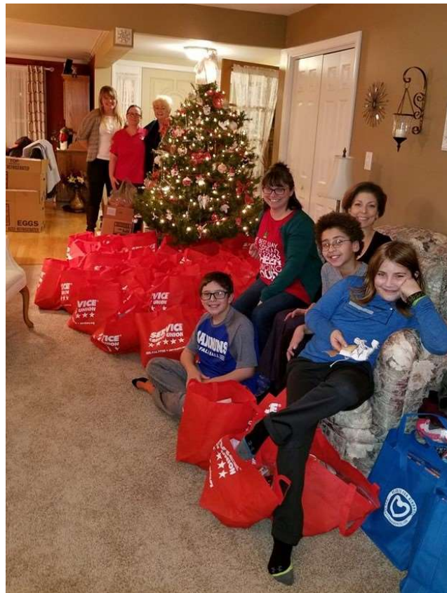
Right: Volunteers rest after their hard work