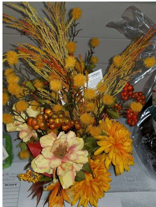
Seasonal arrangement silent auction item