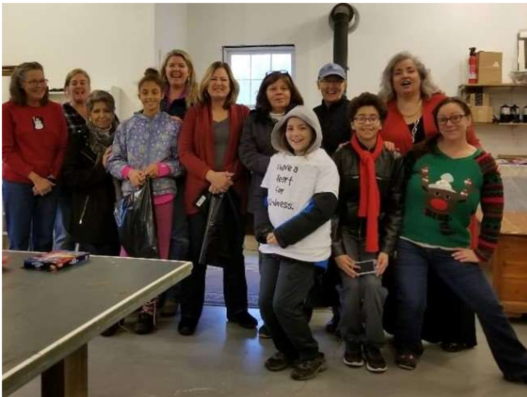
Look at this great group of volunteers!