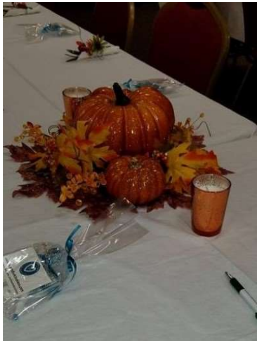
Dressed up table waiting for guests to arrive