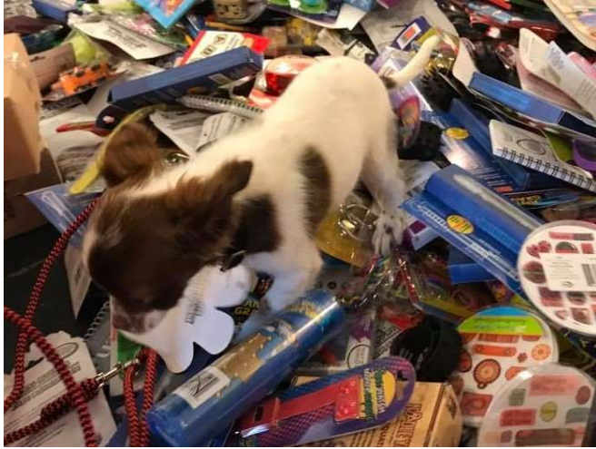
A Hero Pup explores the stuffers

How did H4K manage to distribute close to 400 stockings to area children? Hero Pups , that's how!